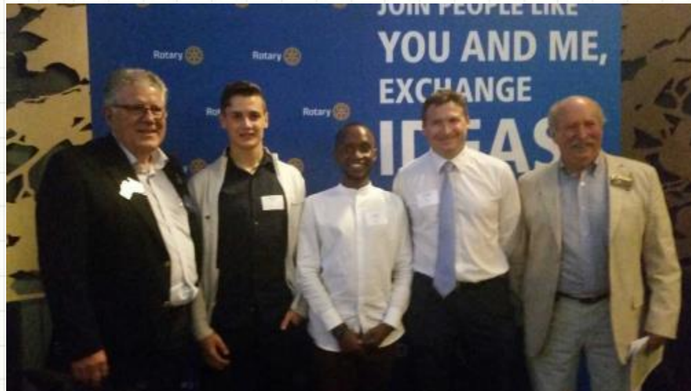
Speakers at Joint District Alumni Reunion – February 2016